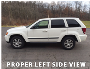
PROPER LEFT SIDE VIEW