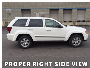
PROPER RIGHT SIDE VIEW