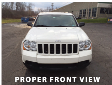
PROPER FRONT VIEW

Photographs received from the applicant will not be accepted.