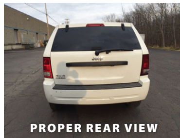
PROPER REAR VIEW